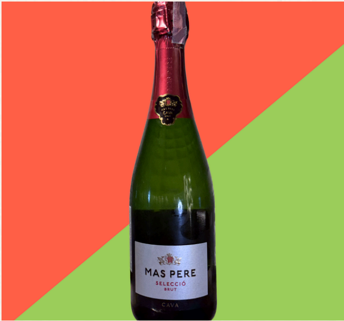
Sparkling PerreVentura Mas Pere Seleccio Brut Cava DO NV Catalunya