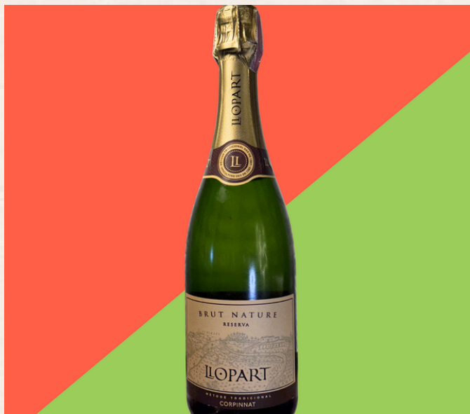
Llopart Copinnat Reserva Brut Nature Macabeo, Xarel lo, Parellada Catalunya