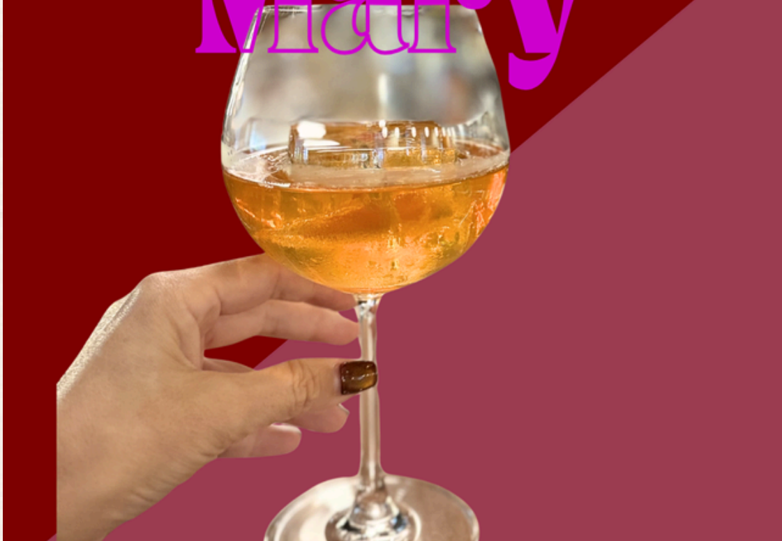
Clarified Bloody Mary