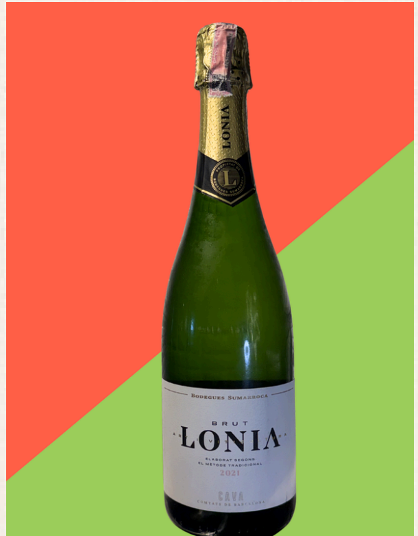
2021 Lonia Cava Brut Macabeo, Xarel lo, Parellada Catalunya